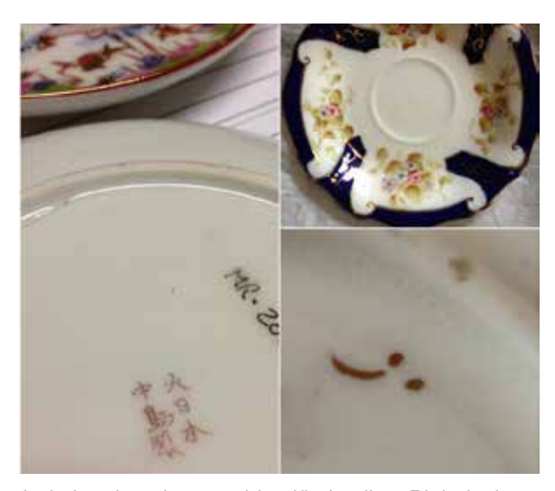
Left the plate that was identified online. Right is the symbol we are looking for an interpretation for.