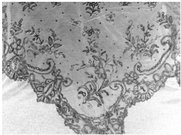
German lace shawl from circa 1875 in our collection.

It is very risky to consider washing a coloured textile without consulting a professional, as many dyes are soluble in water and will run, potentially disfiguring the whole textile. Also, textiles often have metal or leather attachments, which should never come into contact with water. Historic textiles should never be put through a washing machine. Dry cleaning can be an acceptable method of cleaning your historic textile, but only if it is in very good condition. Contact your local dry cleaner for further information.