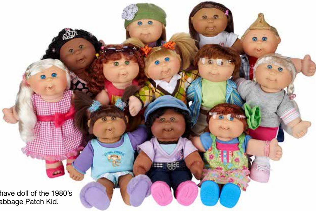
The must-have doll of the 1980's was the Cabbage Patch Kid.