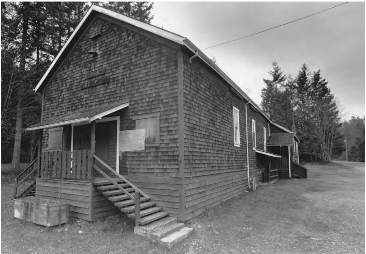
Photo of the Ruskin Hall.

During 1992, the Ruskin Hall Society celebrated the 70th anniversary year of their hall and held a fund-raiser called "Walk for the Floor." The Times had several good photos taken and now we can share them with the community.