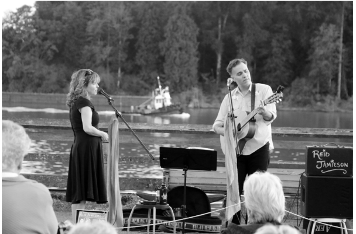
Music on the wharf