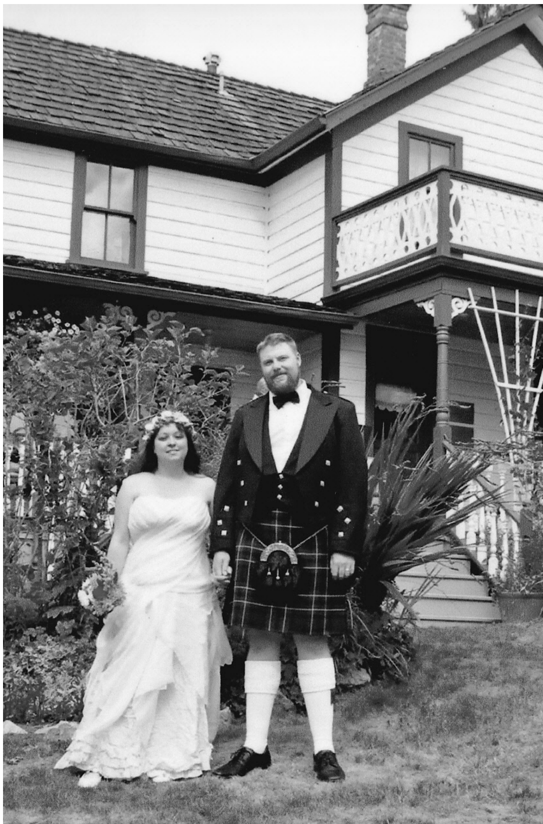
Wedding at Haney House