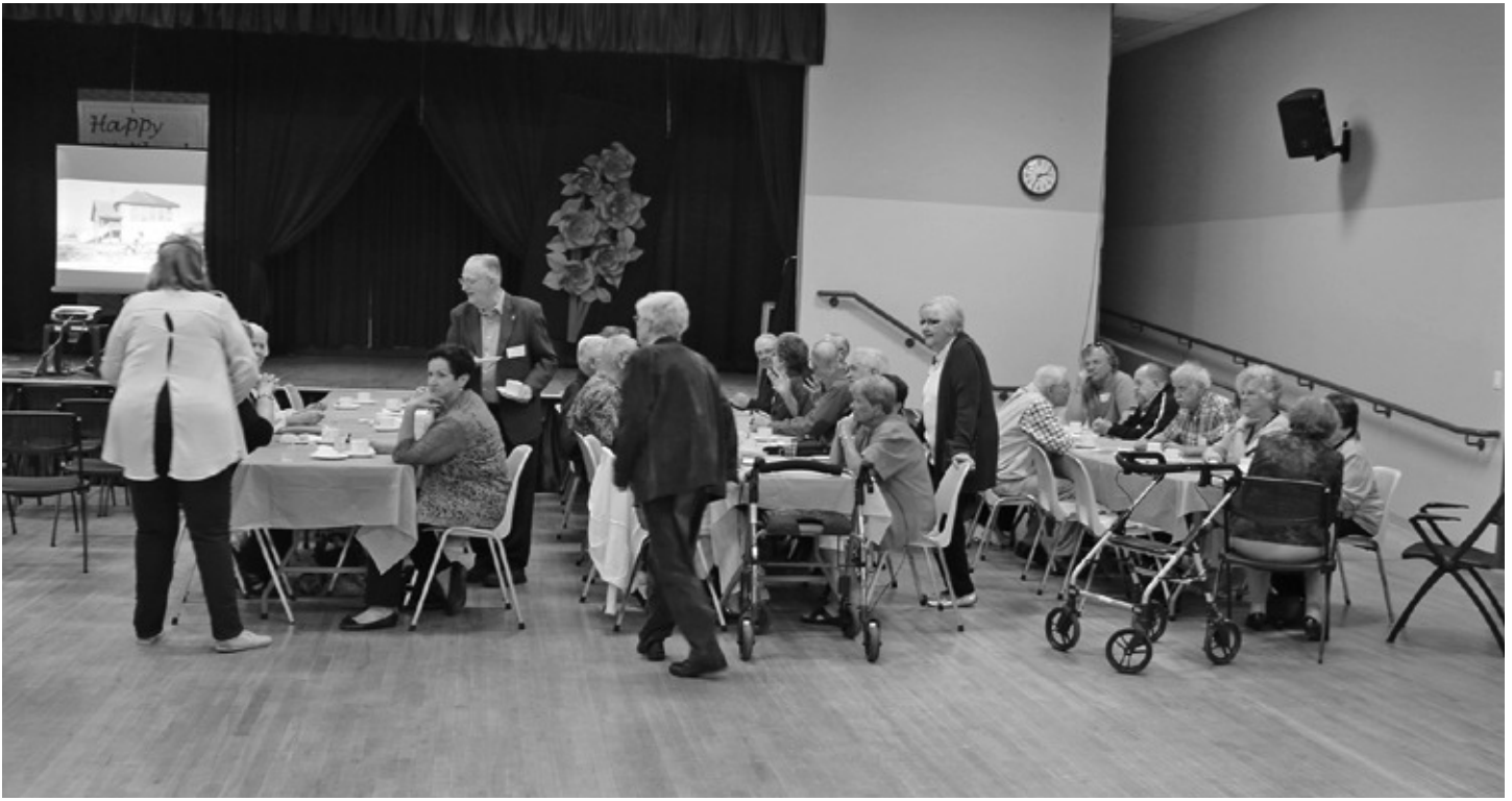
Visiting and reminiscing with old friends are the primary activities at the Heritage Tea.

O UR HERITAGE TEA on April 2nd, 2016 at the Ridge Meadows Senior's Centre attracted 122 people in attendance, which was the same as the previous year, bringing in $1220. The event cost $1222.32.