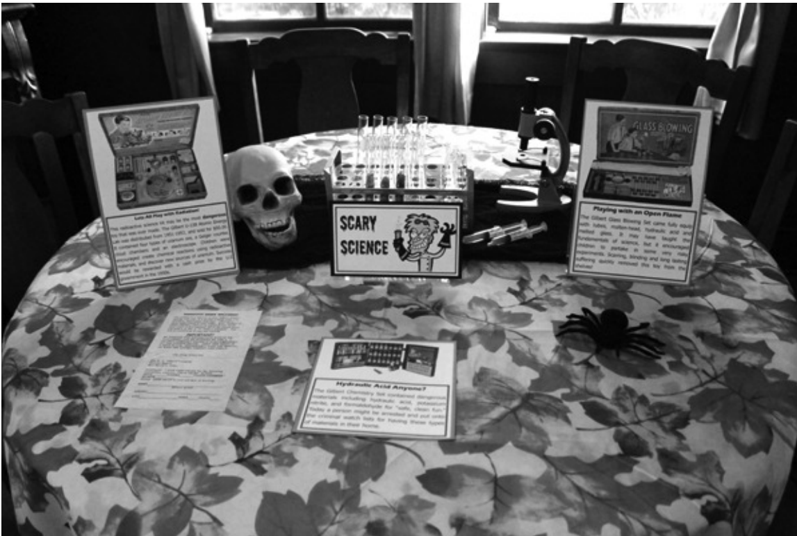
Scary Science display at Haney House Museum for Halloween.