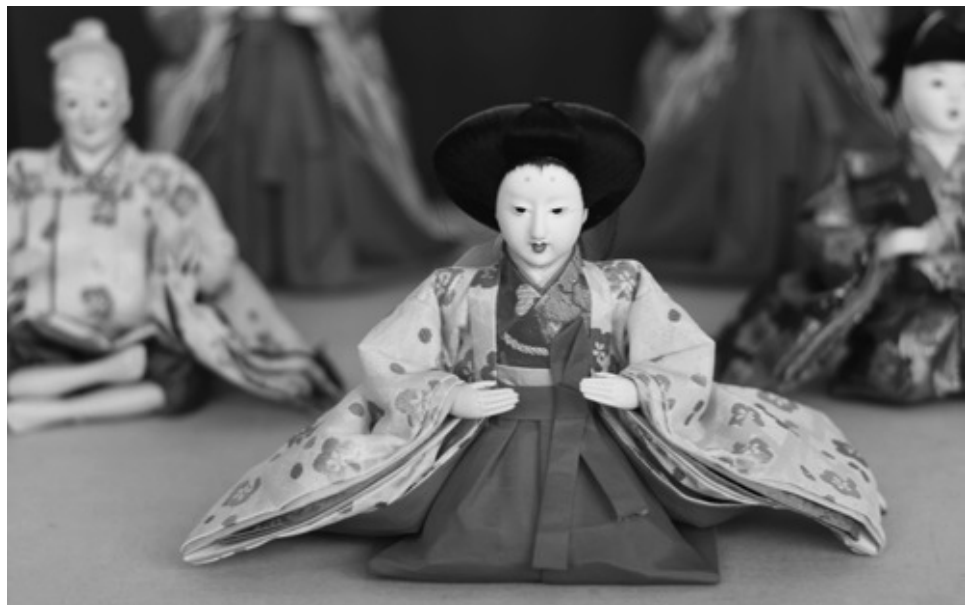
The museum partnered with the Art Gallery at the ACT and loaned them some of our Girl's Day doll collection for their Japanese themed display for Culture Days.