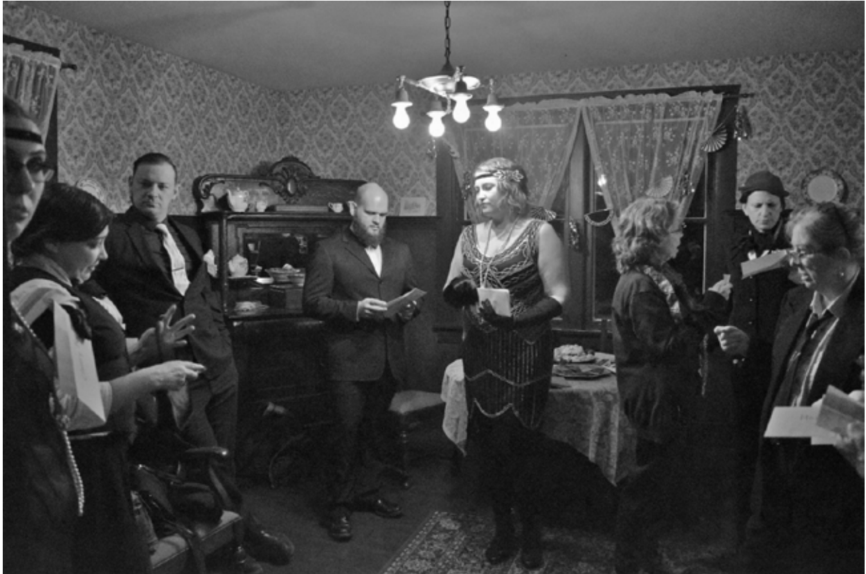
Murder Mystery: Participants at the first "Tampering with Temperance" event.