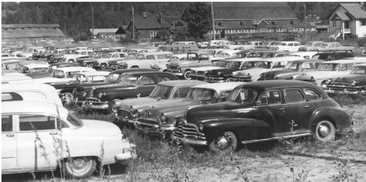
In honour of the beginning of vintage car season, we present this picture of the Albion fair grounds parking lot as it looked fifty years ago in 1961.