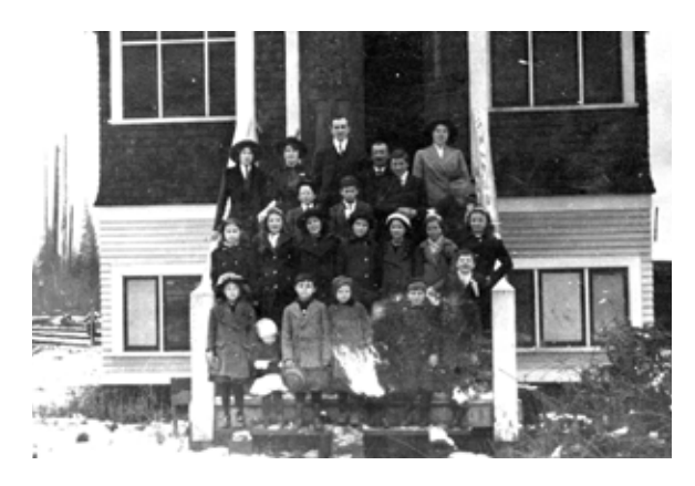
The Sunday school opened when the church did in 1912, but typical of the multi-denominational congregation, it was organized by a group of Baptist women for the primarily Methodist church.