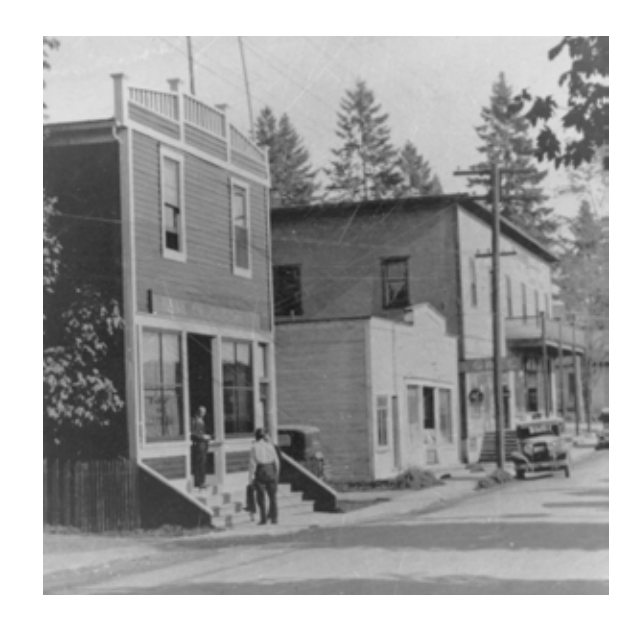
Looking east on River Road before the 1932 fire. Bank of Montreal building (left) was spared but the other buildings burned down.

The postmaster, Mrs. Storey (formerly Mrs. Charlton), built the post office in 1933, after a "fierce blaze" in November 1932 destroyed the buildings at the northwest corner of River Road and Ontario Street including the former Pacific Berry Grower's building, the post office, and C.P.R. station and freight shed across River Road. The old Bank of Montreal building miraculously survived the fire, but what stood east of it was all gone.