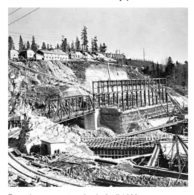
Powerhouse construction in April 1930

In December 1928 the British Columbia Power Corporation decided to build the Ruskin dam and powerhouse at the narrow granite gorge some 6 km downstream of Stave Falls. The work, including a diversion of the Stave River, was completed on schedule in November 1930. At the official opening ceremony two hundred businessmen and politicians dined in the powerhouse, and in the following years thousands of visitors took tours at the facility, solidly putting the name of Ruskin on the map. fb