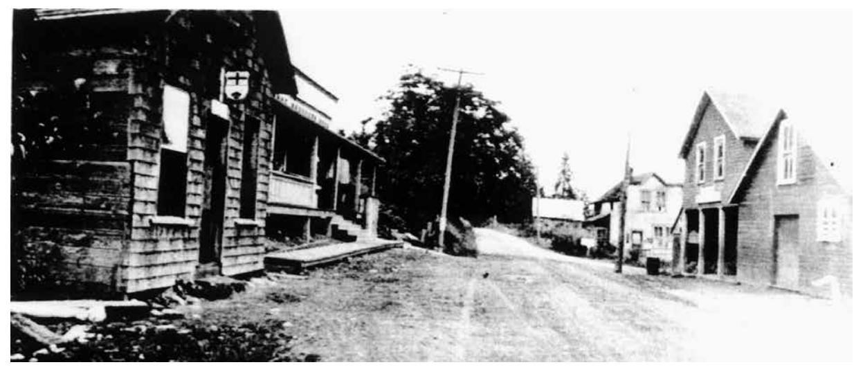
River Road at Whonnock looking east. On the left post office and Showler's store. Right Graham's store and at some distance Luno's. Note the dirt road! Picture was probably taken in the later 1920s.