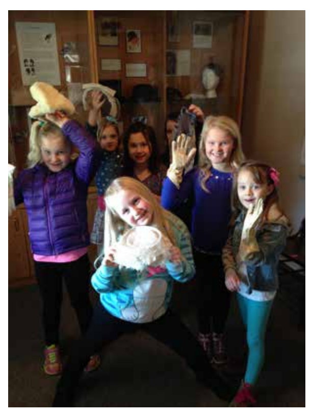
Grade 2-3 students from Kanaka Creek enjoying the hat display in the new cases.