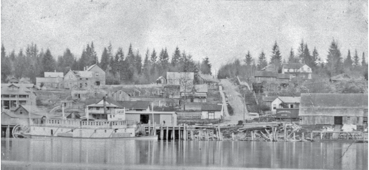
The first picture used by Sheila Nickols for a Looking Back column was this circa 1900 view of Port Haney from the river.