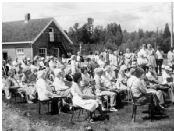
Crowd at the opening of the museum at the brickyard site in August, 1984.

Our first public outing will be with the library displays for February. As this is Heritage Month, we will combine the story of our museum with the Canada-wide Heritage theme of "History Afloat" which will allow us to explore all the