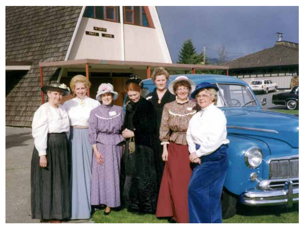
The core group of volunteers at the first Heritage Tea in 1993.