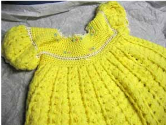
Lemon-yellow crocheted infant's dress from Karen Cobb's donation.