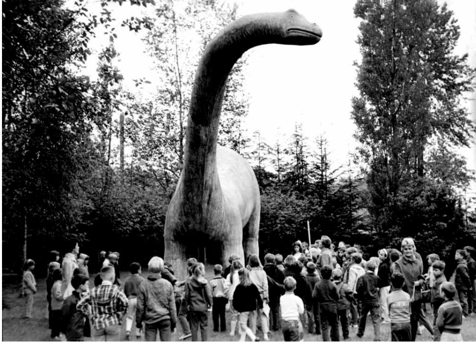
A school class admiring one of Nick Dyck's impressive creatures.