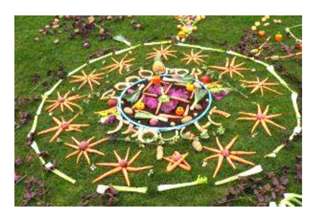
A nature art mandala using found materials.

These Canada 150 geocaches will officially kick off on June 4