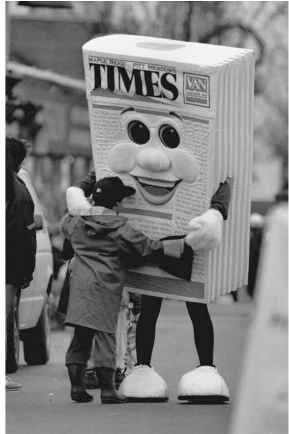
The TIMES mascot, known as “Hacksaw”, in the 1992 Santa Claus Parade.

We will be seeking grant funds to send this collection off to have digital copies made so that we can make them accessible. This will open up stories from the 80’s, 90’s and early 2000’s that we don’t have very well-represented in our collections.