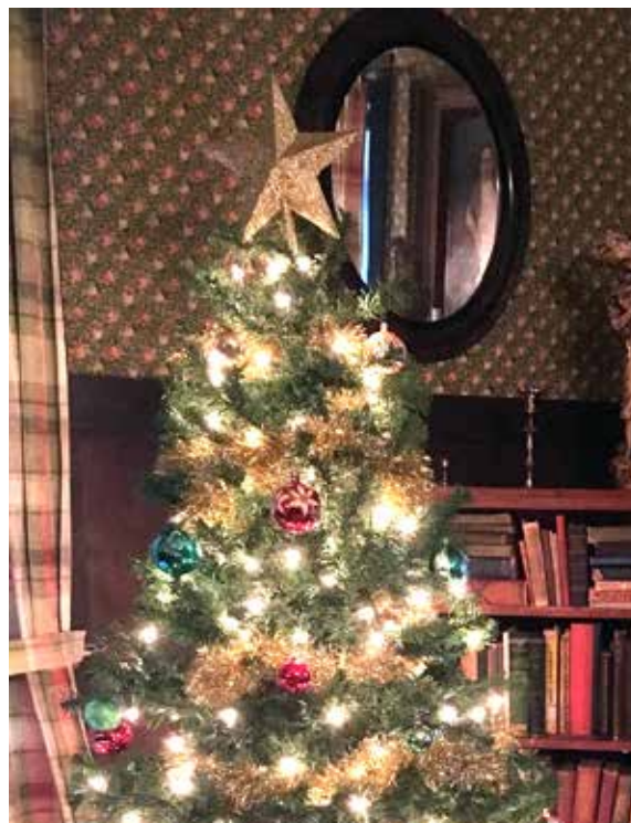
Christmas and holiday photos at Haney House! – November 25th