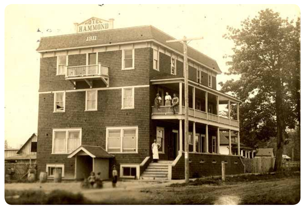
Hammond Hotel – This wonderful picture of the Hammond Hotel arrived this summer. It is the first time we have had a close-up image that shows the roof and the sign. It is such a large building that most people took pictures of sections of it.