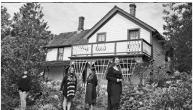
Summer students standing where the ladies once stood on that old photo of Haney House. Remarkable how the house has retained its look after 110 years.