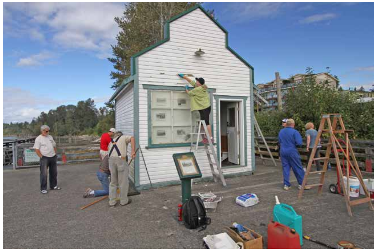
Wharfinger Office cleanup on September 10 – We have some enthusiastic new partners to help us care for the Wharfinger's office.

New residents of the "Reflections on the River" condo development next to the Billy Miner Pub offered to help repaint the building on Sept 10 and have also agreed to watch over it from their balconies.