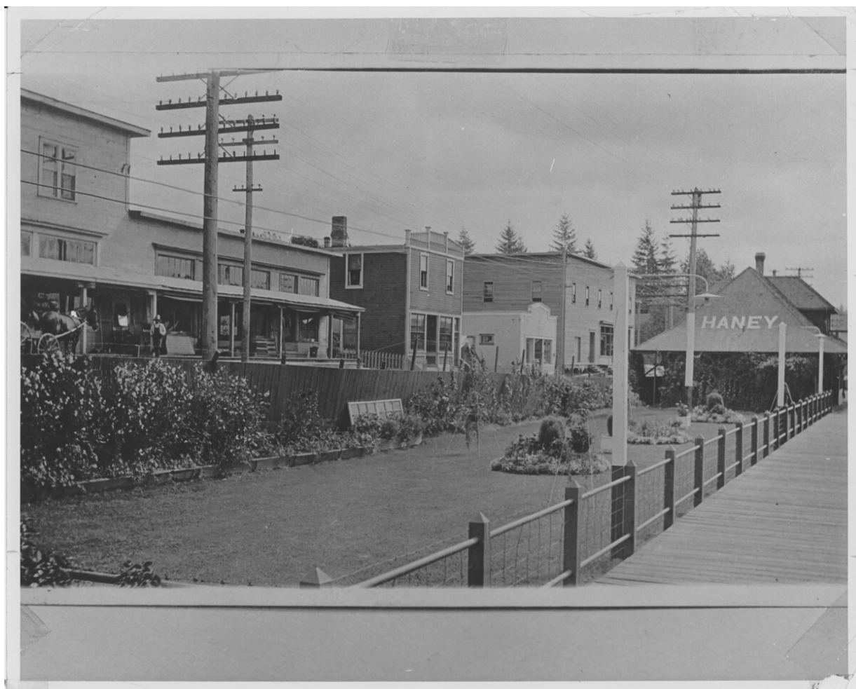
Port Haney in 1912.