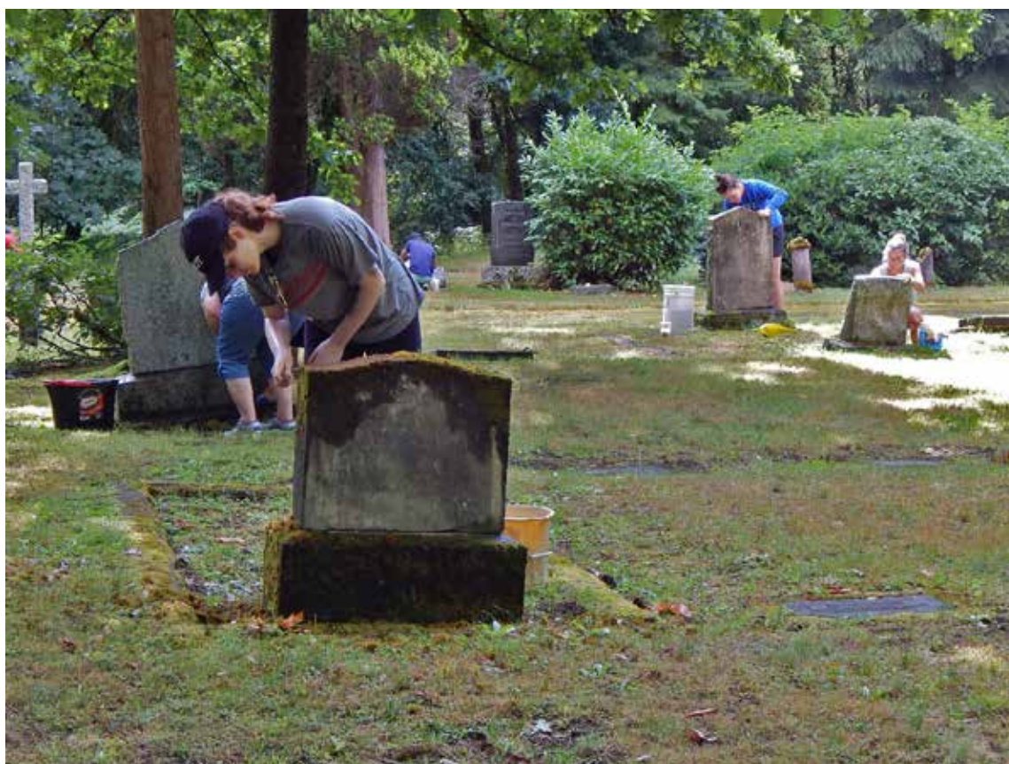
Our crew of staff and volunteers cleaning headstones at Whonnock Cemetery.

The drop in volunteer hours is due to the lack of a big Family History Group project in 2019.