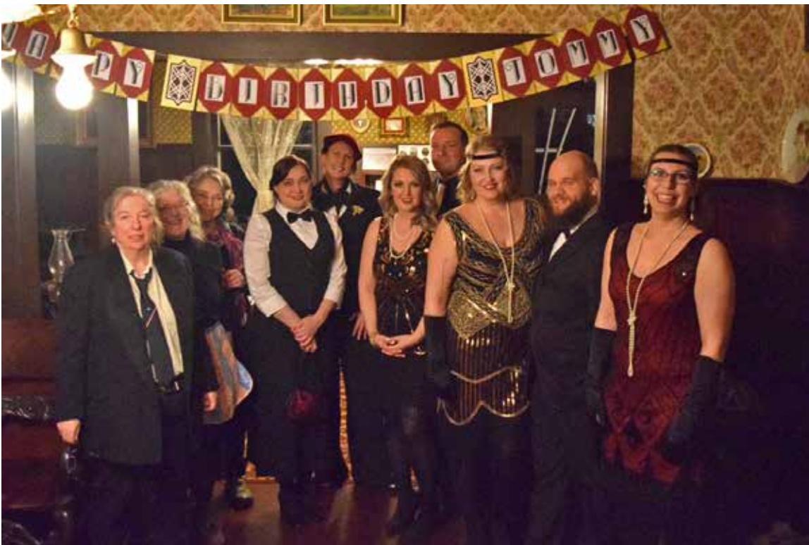
Murder Mystery – The group assembled in the parlour. The “Happy Birthday” banner was a prop for the story.

Groups were encouraged to dress up along with the 1920's gangster theme and they did not disappoint, with everyone coming in their flapper finest. This event has successfully brought in a new demographic into the museum space.