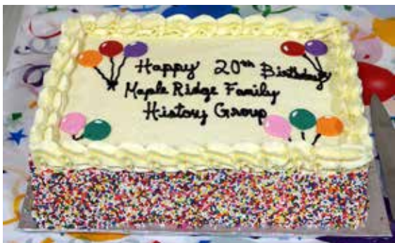
Birthday cake for the celebration of the 20th anniversary of the Family History Group.