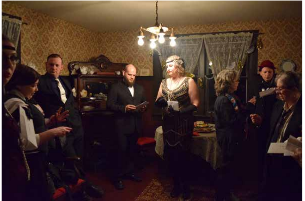
Murder mystery night goesers enjoy the ambiance of Haney House dressed in their 1920s finest.