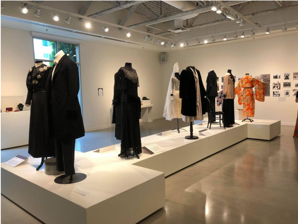
The Bee's Knees: 1920's Fashion in Maple Ridge, on display at the ACT gallery.