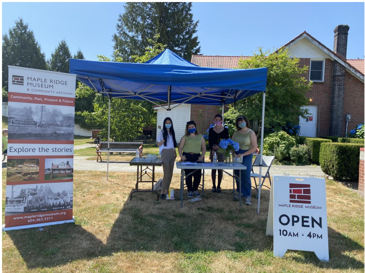
Summer students and volunteers at the Museum in the Park tent

On weekends during the summer, our team of summer students set up a tent and a rotating educational display in the park outside of the museum. This was run as a pilot program for the upcoming Museum on the Move. Excited students were able to interact with patrons of the museum in a safe socially distanced way outside of the small spaces of the museum. Through this and other programs we were also able to recruit a set of dedicated event volunteers to assist with our future programs and events.