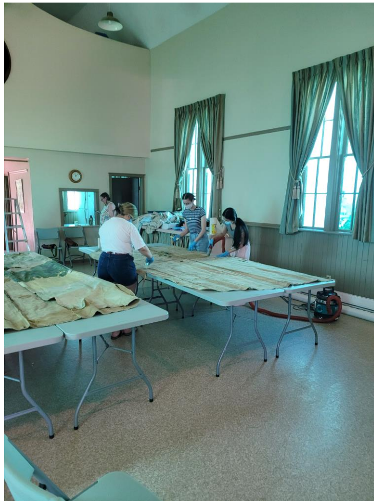
Conservation being done on the newly acquired Sampo Hall mural at St. Andrews church, July 2021.