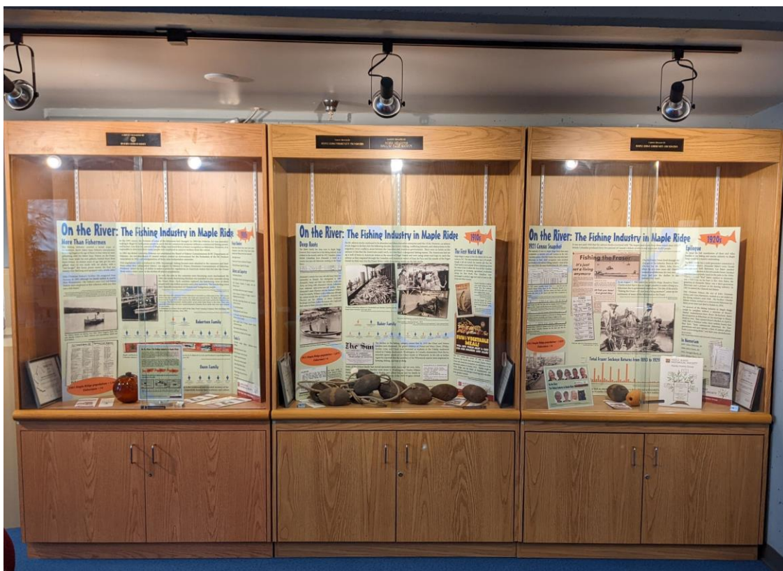
"On The River" display at the Maple Ridge Library

On the River: The Fishing Industry in Maple Ridge tells the compelling story of the families involved and the importance of fish to the local economy and the community of Maple Ridge from its colonization and settlement in the 1890s, technological change, increase in government oversight, the First World War, the rise of unions, and to the brink of the Great Depression in 1929. http://mapleridgemuseum.org/about-us/family-history/