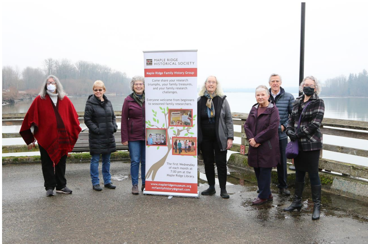
Maple Ridge Family History Group at the Port Haney Wharf receiving their Maple Ridge Community Heritage Award

The Family History team has logged 54 hours of time for communications, website updates, and program coordination.