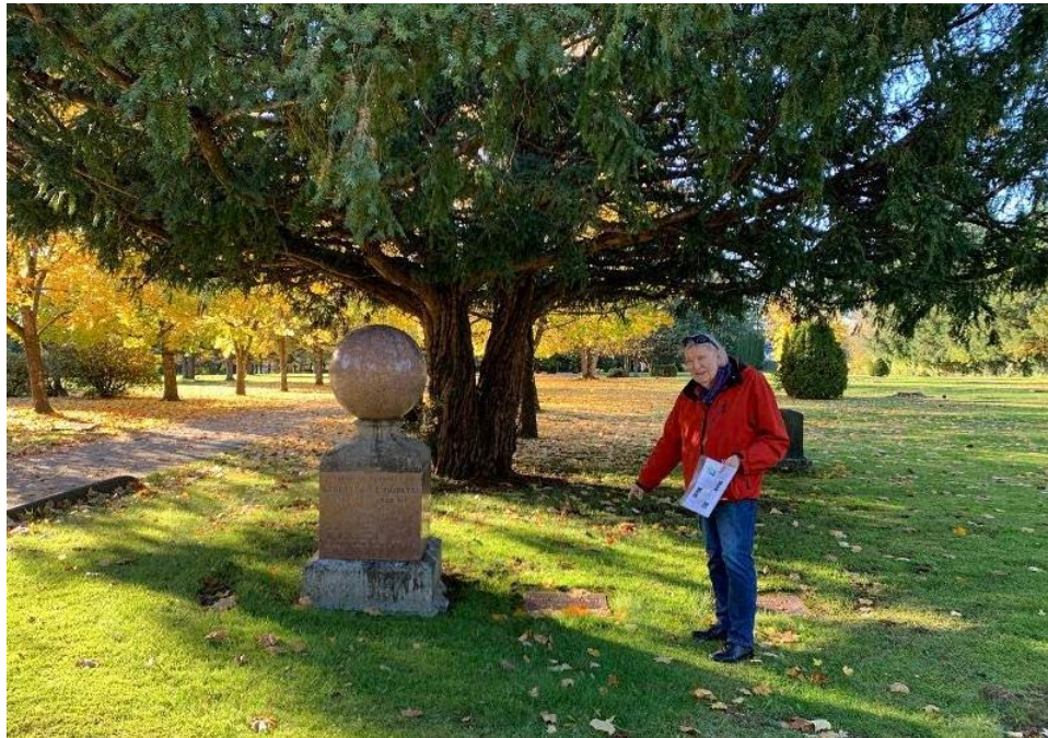
Cover Photo: Detail from the Sampo Hall mural