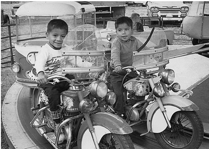
P02016 (1960s) Children on a ride at the Albion Fall Fair