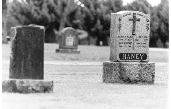
P13682 (1994) Headstones in Maple Ridge Cemetery

Maple Ridge is home to two historic cemeteries that hold nearly 150 years of history. Always a worthwhile reason to spend a few hours outdoors, our annual cemetery clean up will return for another season. Do your part to help preserve our local heritage at any of three events (July 15, 17, & 24). Stay tuned to our website for more details and sign up instructions.