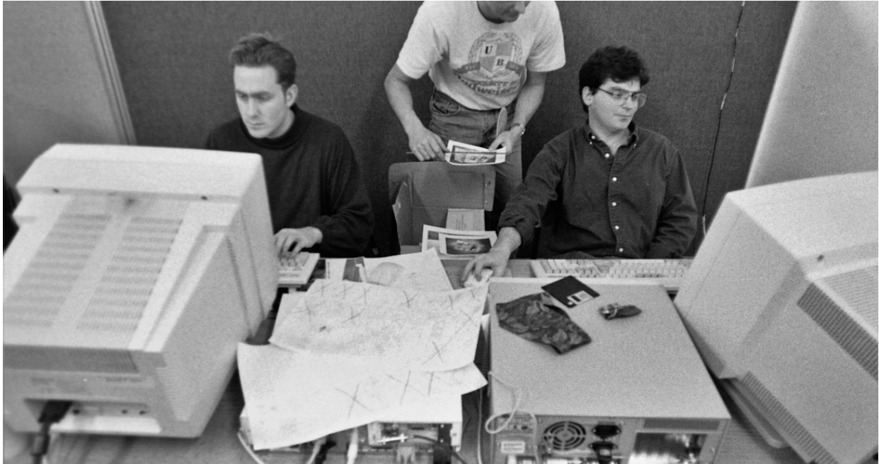
P14255 (1994) Times staff at work