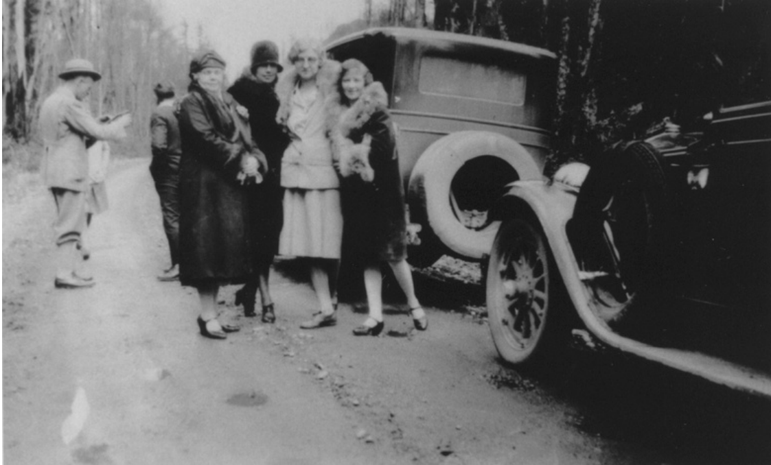
Webber family excursion in 1925 (P02934).