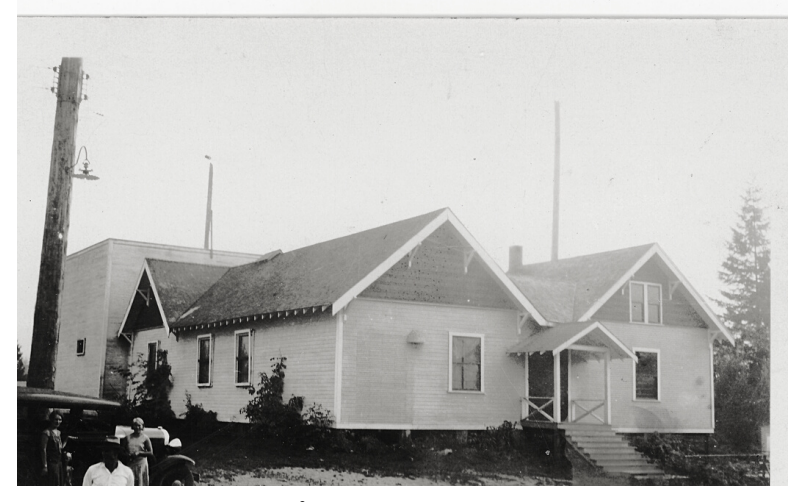
Sampo Hall in Websters Corners c. 1930

We pick up our story with the reserving of one acre of land from the original and now defunct Sampola Finnish Commune for the building of a community hall. With the population growing, Websters Corners was in need of a community gathering place, other than the school. So community members got to work planning and laying the groundwork. They spent three years accumulating materials and fundraising. Construction finally began in 1915 using entirely volunteer labour by the whole of the Finnish community including men,