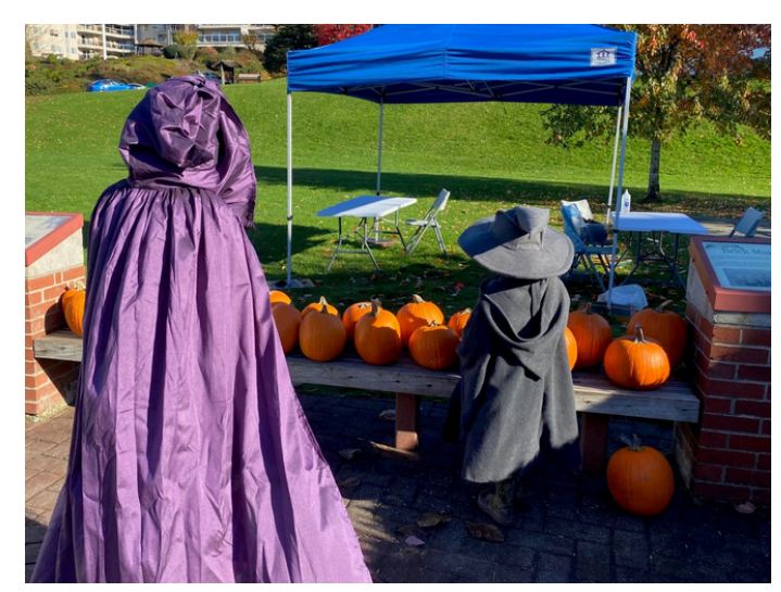
On Halloween weekend, a mother and son dressed as wizards pick out a pumpkin to carve during our Family Fun activities.