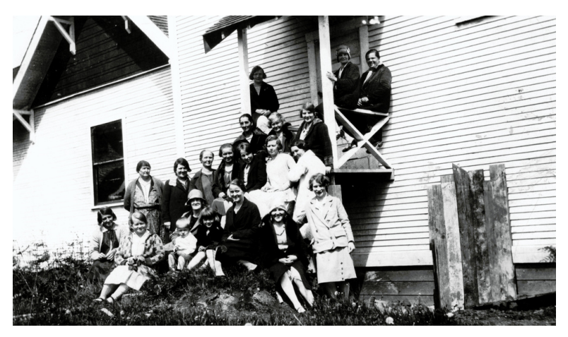
Members of the Finnish Women's Club on the front Steps of Sampo Hall in the 1920's

The hall operated as a community centre from 1916 - 1984 closing only briefly during World War II after it was shut down by the RCMP for being a suspected gathering place for communists. At the start of the war the national government put a ban on several Finnish political groups suspected of communist activity. Any gathering or gathering place suspected of harbouring meetings of these groups was shut down, including Sampo Hall. The