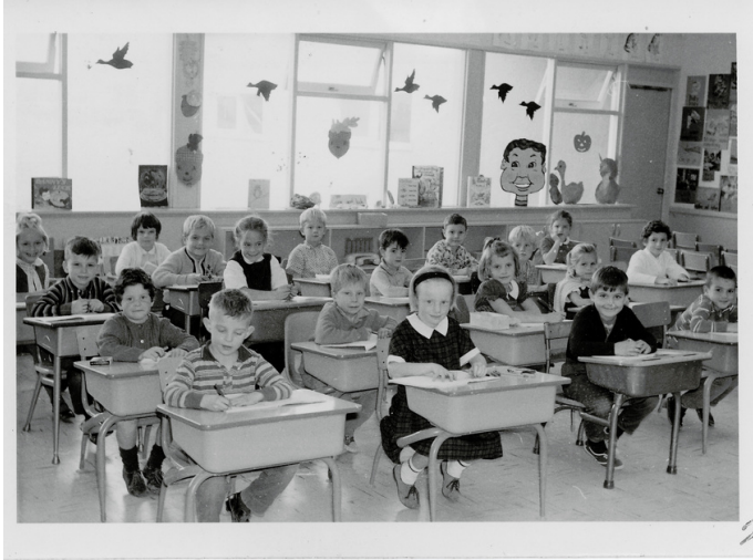
1965, Maple Ridge. Students are seated in classroom. (class details unknown)

Looking for things to do with the kids this spring break?