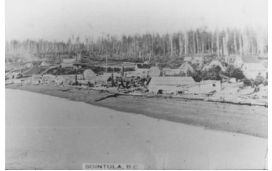
The community of Sointula from the dock around 1920.

At the Sointula Museum, a team of volunteers, including their volunteer curator, manage and preserve the town history. The museum acts prominently as a centre for family research for Finnish descendants not just from Sointula but all of BC and even Canada. They have easily accessible historical materials, artifacts, stories, and videos all on display. But possibly the best piece strikes you immediately upon entering, a twin mural to our own painted by none other than Toivo Aro himself.