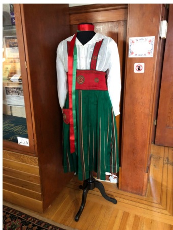
Traditional Finnish Dresses on display at the Sointula Museum (Left) and Maple Ridge Museum (Right)