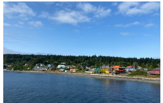
Sointula seen from the incoming ferry, Summer 2021.