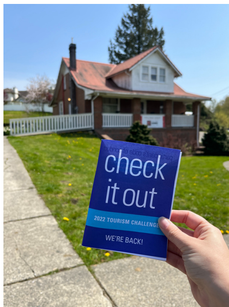
The Tourism Challenge is bring many new visitors to the museum!