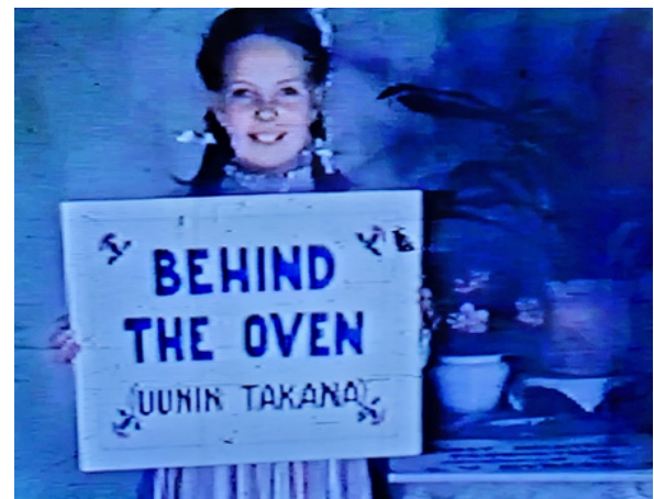
Still from the film, Uunin Takana.

For many, the film features familiar faces and sights. Uunin Takana also presents a rare opportunity to see what Webster's Corners was like during that time and how the landscape and neighbourhood have changed. The film, along with the exhibit Sisu: Finnish Resilience in Webster's Corners , will be on display until August 28th.