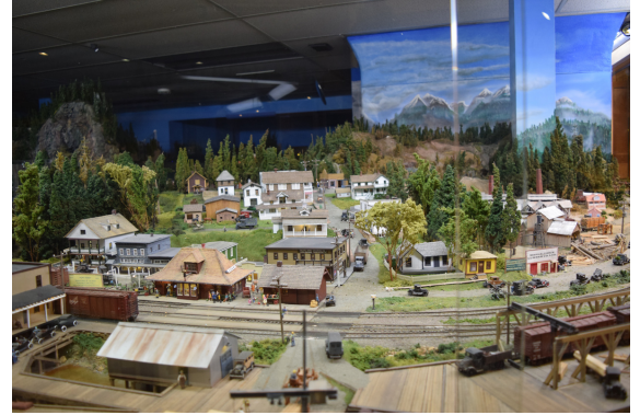
DARS Port Haney model train in the main gallery

The Dewdney Alouette Railway Society Open House Sundays are back! DARS will be operating and giving tours of the front gallery of the train display on the last Sunday of every month. DARS members are thrilled to be back and giving tours of their incredible creation, but please keep in mind that the lower level of the museum is a small space and masks are still required and group size is limited. On busy train days groups may be asked to wait upstairs or outside until there is space to allow for social distancing. Please enter the train room through the upper level of the museum. Welcome back!