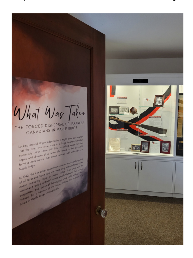
Exhibit explores history of local Japanese Canadian community

The Maple Ridge Museum is proud to present "What Was Taken: The Forced Dispersal of Japanese Canadians in Maple Ridge", which opened on October 27. This year marks the 80th anniversary of the internment of Japanese Canadians. The exhibition shares the history of Maple Ridge's Japanese Canadian community through objects, historical images and the stories of various Japanese Canadian families.