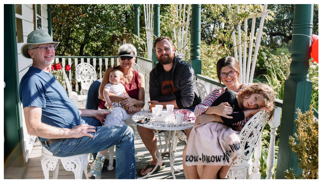
A family sits on the veranda during Apple Harvest Festival.