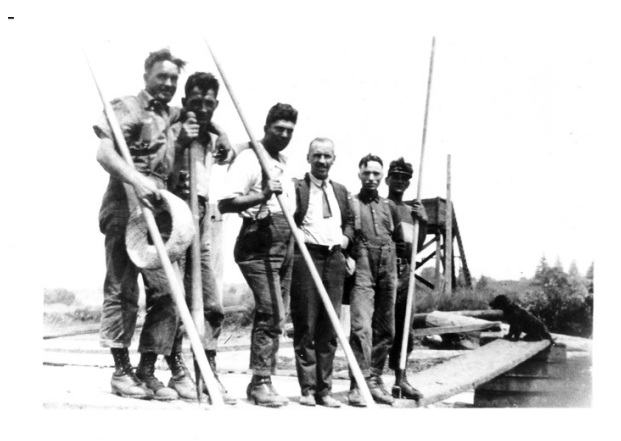
Six men with pole pikes at Kanaka Creek, employees of ALLCO, 1923.