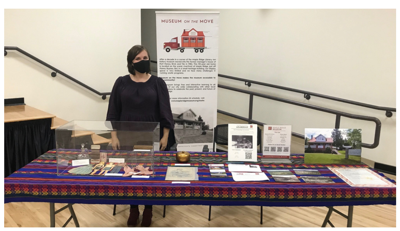
Our display at Repair Café included artifacts that have either been repaired or were used for repairing other objects.