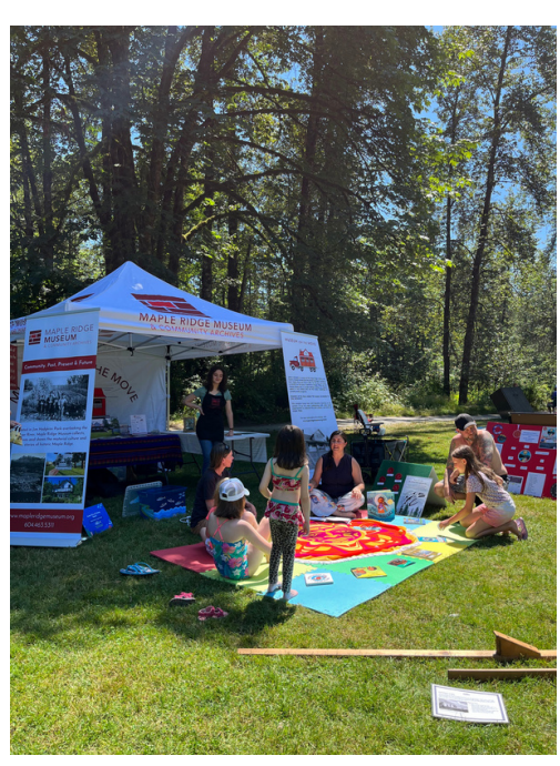
Thank you for supporting Museum on the Move in 2022!

We closed out 2022 with a couple fantastic events! On November 19 we attended our first ever Repair Café with a fun display of artifacts that have been repaired, or were used for repairing other objects. We are excited to be attending another Repair Café in March! In December, we hosted an Ornament Making workshop for children that received excellent feedback. Lastly, we opened Haney House during the CP Holiday Train and received quite a few visitors!