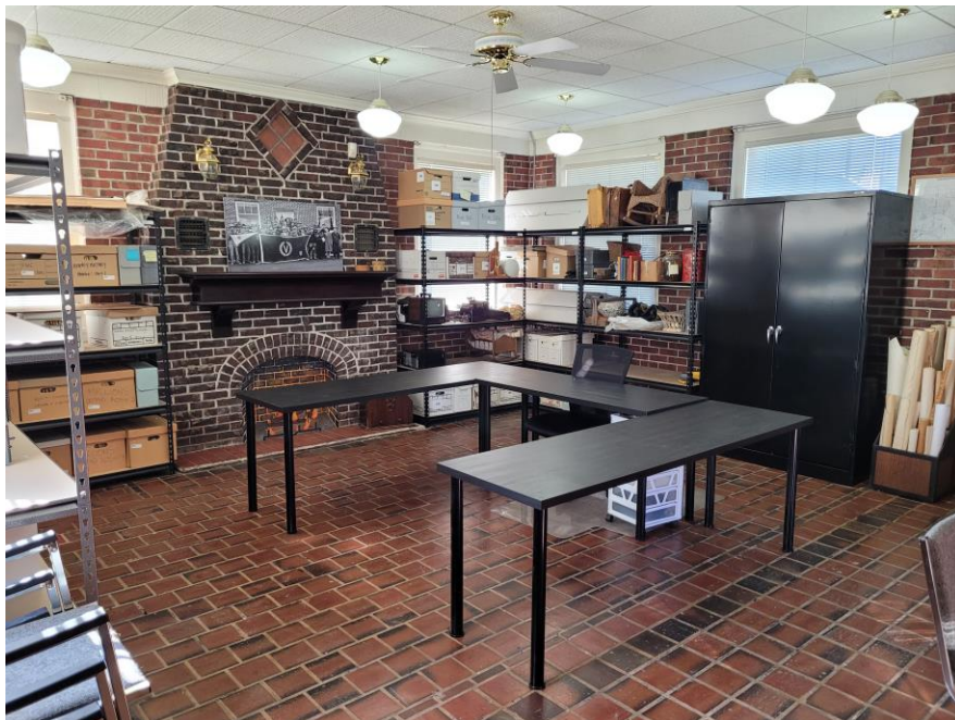
The newly renovated archives at the Maple Ridge Museum after opening in February 2022.

Archival processing projects remain ongoing and new digitization and damage-remediation projects began in 2022 that will update the collections and help preserve vulnerable media for access in the future.