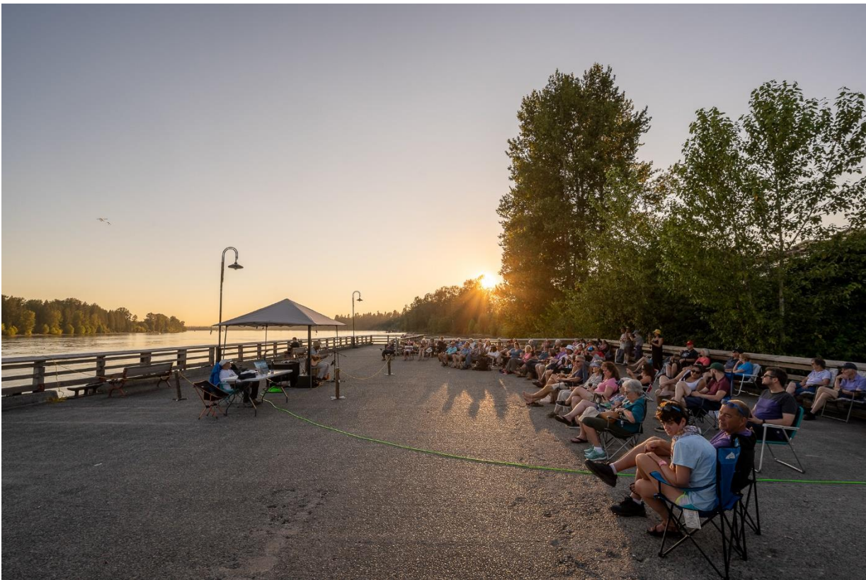
Etienne Siew performs at Music on the Wharf July 25, 2022.

We were thrilled to be able to bring Music on the Wharf back to the historic Port Haney Wharf in 2022. We had four amazing bands/artists who brought a variety of musical styles to the wharf and had between 60 and 120 patrons per performance.