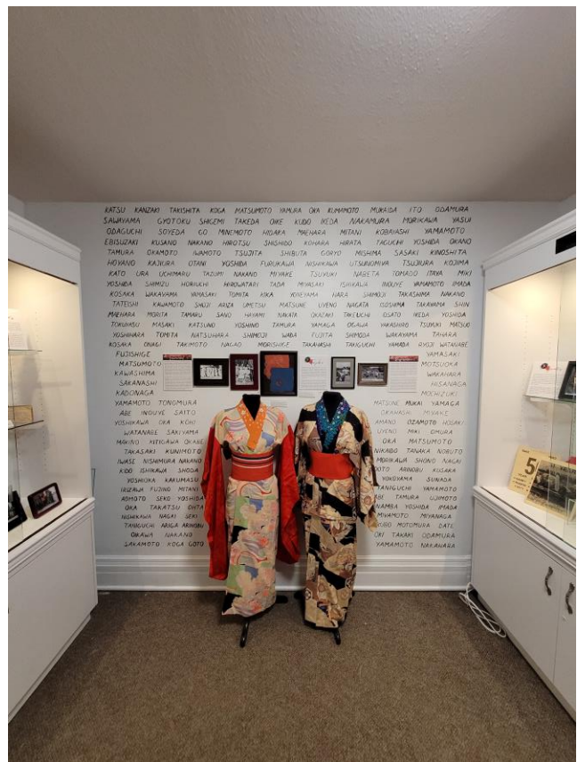
Photos from 2022's special exhibitions, Sisu (left) and What Was Taken (right).