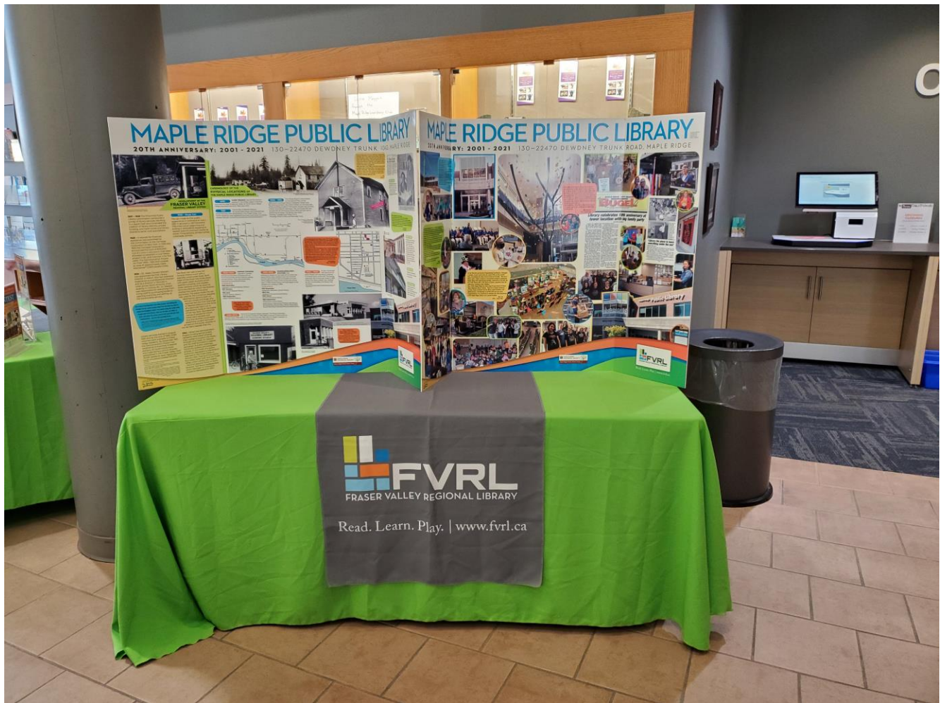
Presentation of research done for the Maple Ridge Public Library, on display at the library.

Also in 2022, we completed a project for Maple Ridge Public Library. The library was one of the first branches established by Fraser Valley Regional Library system and has been open since 1930. The project highlighted the history of Maple Ridge library and the beginning of FVRL. Additionally, one of the two presentation boards was a photo collage of current and retired staff, members of the public, and library programs.