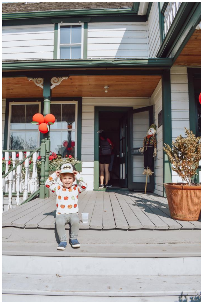
Visitors enjoy everything apple-themed at Apple Harvest Fest on October 2, 2022. Apple Harvest Fest was also part of BC Culture Days.

Finally, the wonderful people at Cornerstone Supernatural facilitated In the Dead of Night, our annual public paranormal event. This two-day event sold out and the museum raised over $5800!