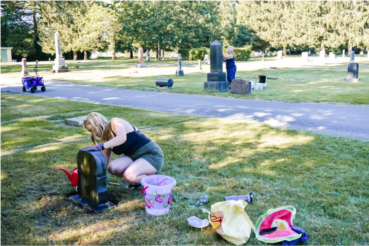
Volunteers brave the heat and the mosquitoes to clean headstones in Maple Ridge Cemetery on July 14, 2022.

Our annual Headstone Preservation Project dates were July 14 and 16. Close to 100 stones and plaques were cleaned over the two days. A person with an infant buried at the cemetery reached out to us and asked us to tend to her child's grave as she was unable to, and that inspired us to add a third session on August 18 that focused on one of the children's sections.