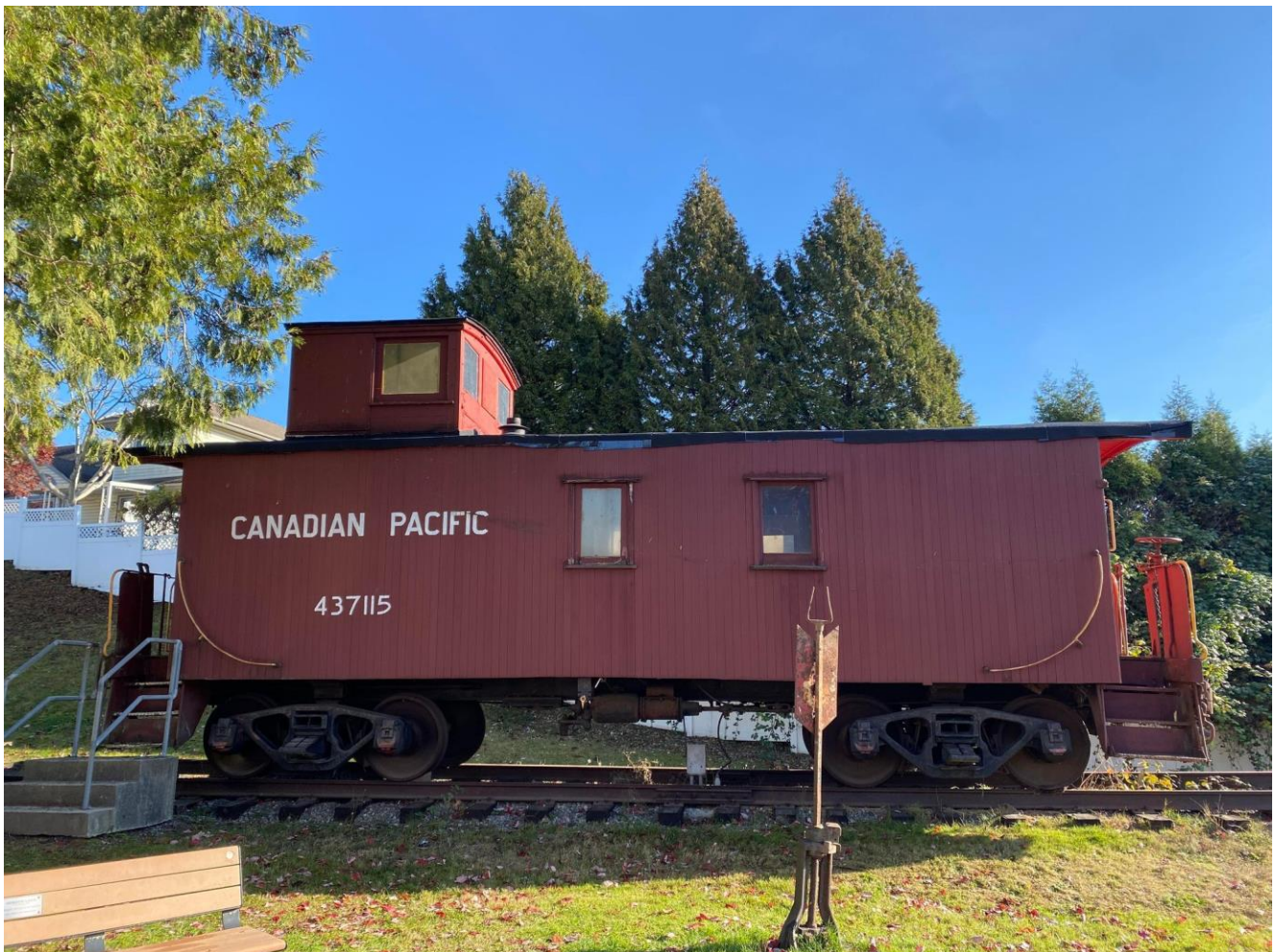
The caboose on the museum grounds after the roof repairs in November 2022. The caboose is jointly operated by the Maple Ridge Historical Society and Dewdney Alouette Railway Society.

We intend to take the energy from 2022 into the next year and expand on what we have built with our renovations, new programs, and expanded server. We intent to use this expanded digital space to focus on hosting our digital archives for the whole community to enjoy and access.