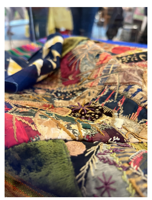
A close up of our display at Repair Cafe on March 18

held our annual AGM and enjoyed some delicious food brought by our members. For the first three weeks of April we held Trees In Bloom in order to drive more people to visit our exhibit, What was Taken: The forced dispersal of Japanese Canadians in Maple Ridge, in partnership with Vanilla Bean Bakeshop and Maple Ridge Florist. We kicked off festival season with Earth Day on April 22. Lastly, the 2023 Tourism Challenge started on April 22 and over the first two weekends we had over 200 visitors to the museum as part of the challenge.