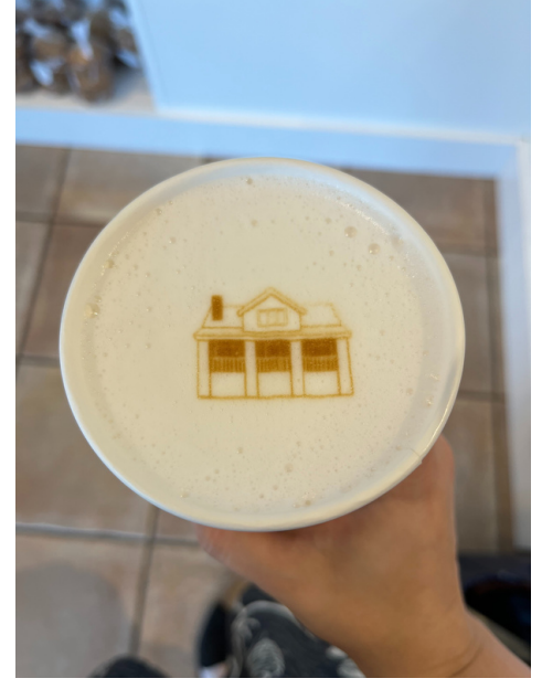
Vanilla Bean Bakeshop put our museum on their lattes during Trees in Bloom