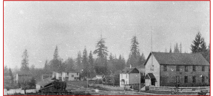
First municipal hall and several houses, circa 1920s.

far to illustrate the machine gun mounted on a concrete pad in front of the first Maple Ridge Municipal Hall. The grainy 1920s panorama shows the Hall and adjacent police station somewhere in the grounds of Memorial Peace Park. There seems to be a suggestion of the wheels and tongue of a gun carriage at the street.