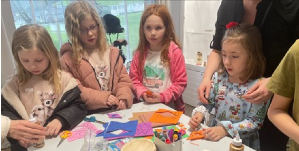
Children put their own spin on ornaments during our second annual Holiday Ornament Making workshop