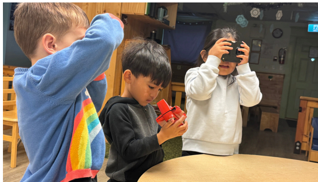
Children at Little Willows test out ViewMasters during the Puppets and Projectors presentation on January 21.

We have been working on creating more programs for different age groups, and in January we presented our brand new preschool-aged presentation, Puppets to Projectors , for the first time at a local preschool. This presentation looks at projection and some of the ways people have been entertained at home throughout time - without TVs and tablets.