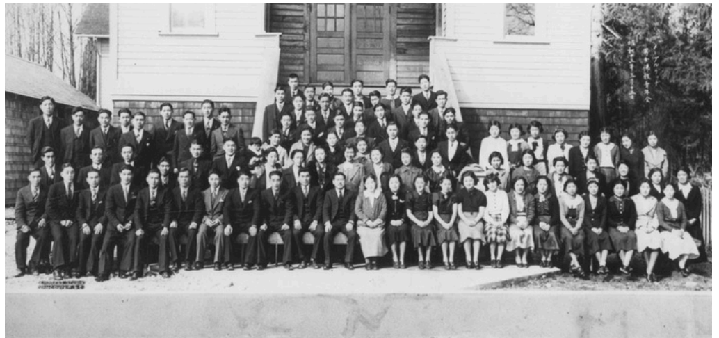
Fraser Valley Agricultural Association directors at Hammond Hall, 1942

We are excited to announce that the Maple Ridge Museum is a proud recipient of a coveted Japanese Canadian Legacies Fund grant. These grants are generously funded by the Japanese Canadian Legacies Society (JCLS). The Museum received $275,000 in funding for various projects focused on educating the public on the Japanese Canadian community in Maple Ridge prior to the 1942 uprooting and displacement of 22,000 coastal-living Japanese Canadians. Maple Ridge was home