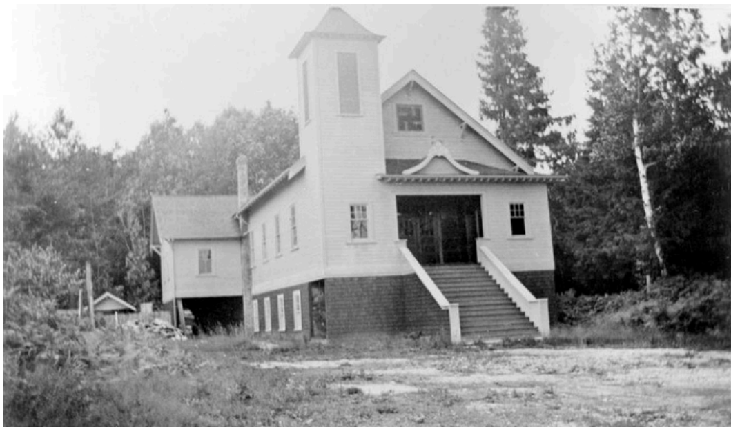
Maple Ridge Buddhist Temple after it was built in 1933.

Heritage Building at Risk of Destruction