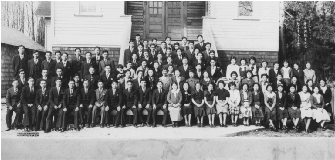
Young men and women's society posing in front of the Buddhist Temple where they held meetings, 1937. P01365