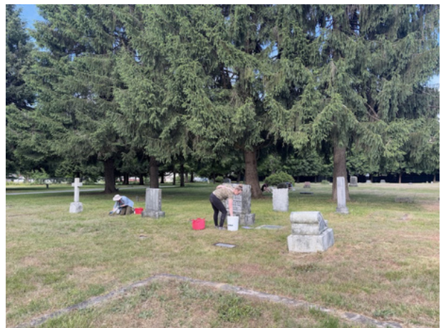
Left: Our Summer Students, Charlize, Sophia, and Gurnoor at Canada Day