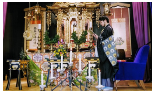
Maple Ridge Buddhist Temple shrine today, installed in the Winnipeg Buddhist Temple since 1951.