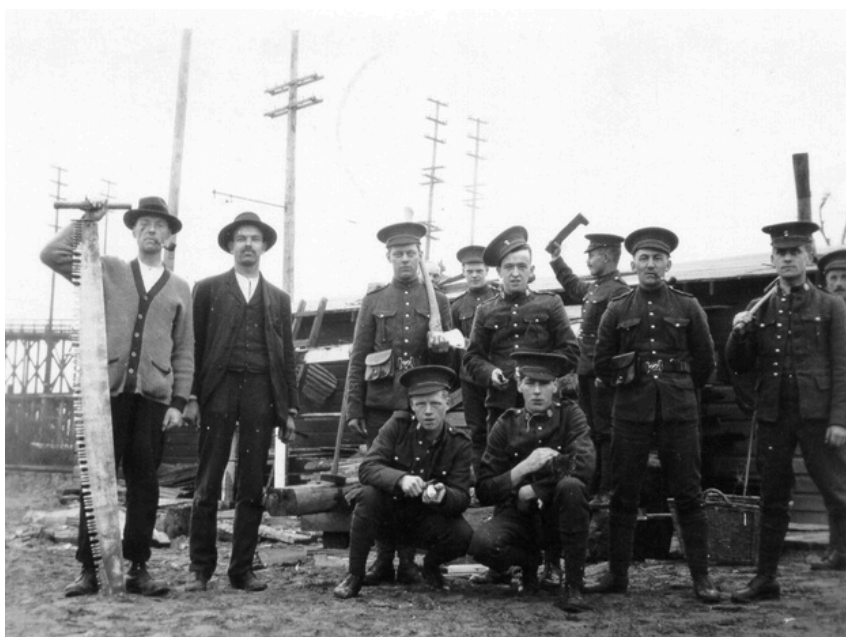
P04363 - A group of soldiers, and a cat, fooling around for the camera at some unknown location 1915