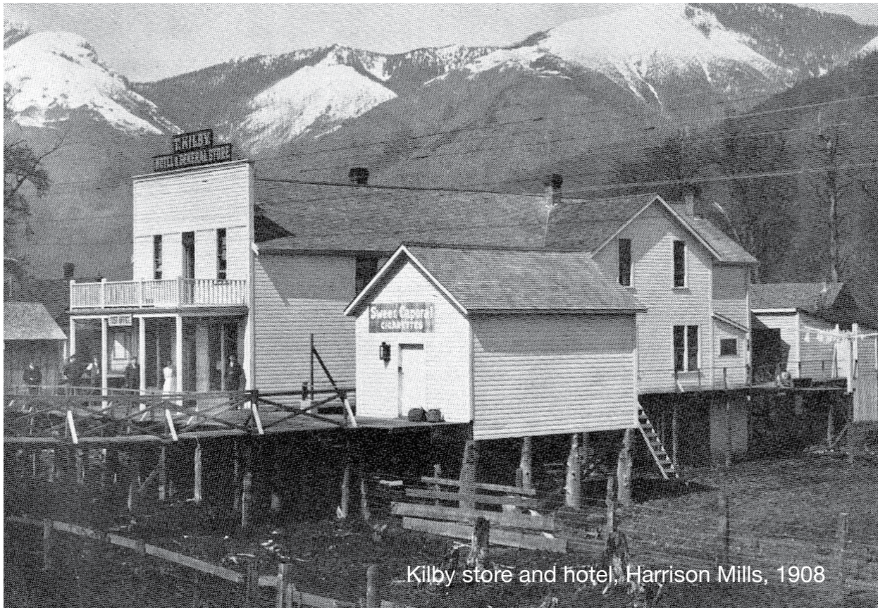
Kilby store and hotel, Harrison Mills, 1908