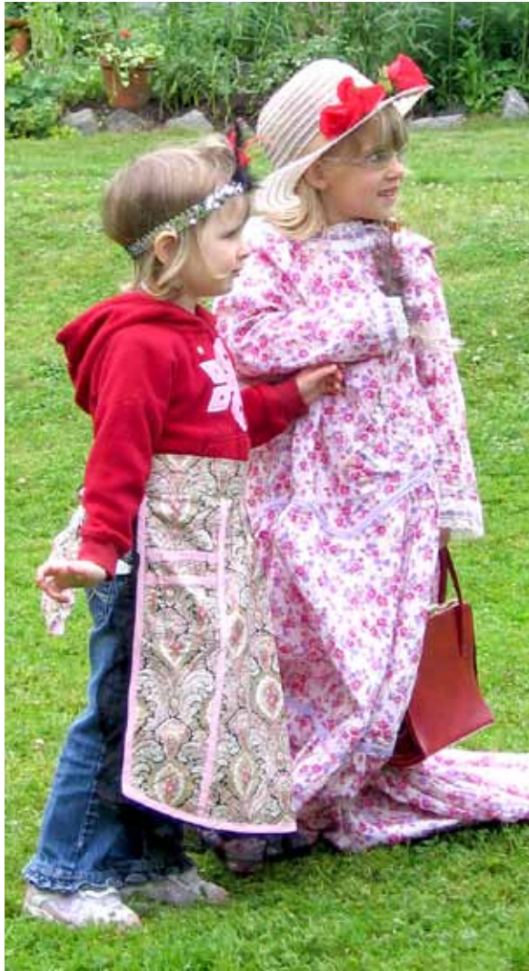
Two little beauties explore the dress-up collection at Canada Day 2010.