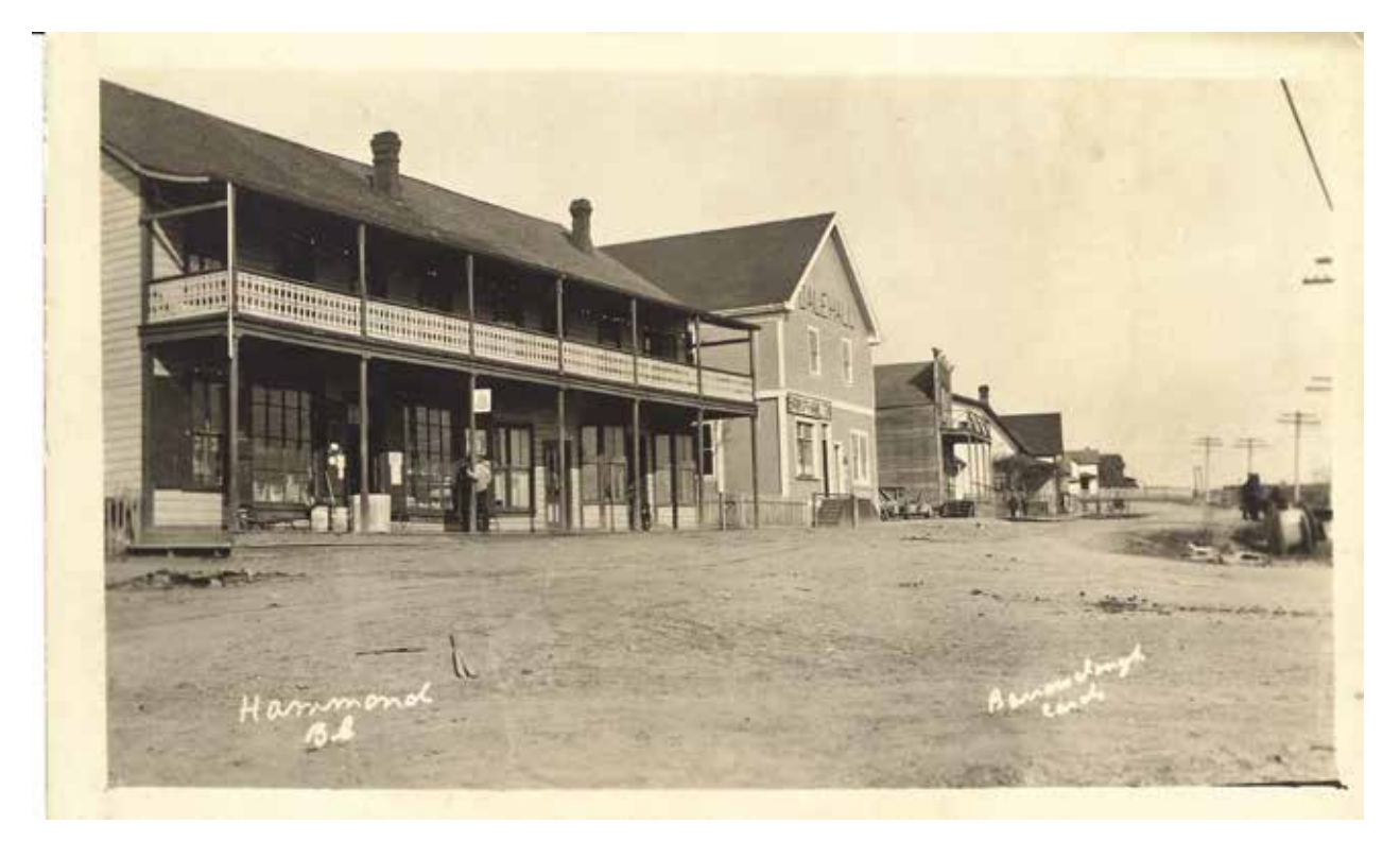
George Alfred Barrowclough photo of Maple Crescent in Port Hammond in 1909-10