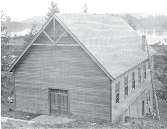
The Ladies Hall in 1912.

beginning of Ruskin as a distinct community. Whonnock Creek became the natural boundary between the two communities.