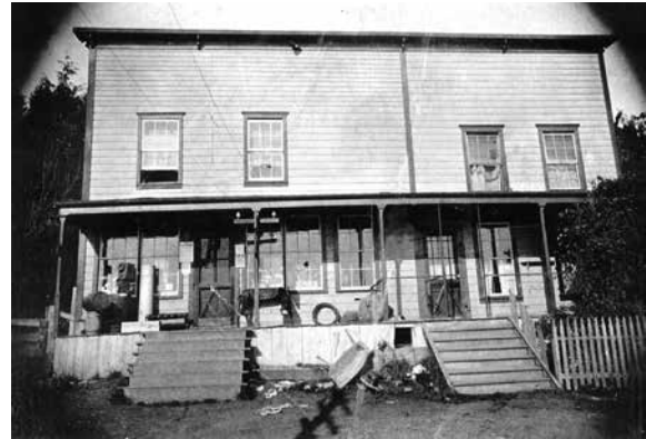
The first Whonnock post office opened in the general store in 1885. The place where the store once stood is now under Lougheed Highway. The building burned down in March 1916. The part to the right is the home of the shopkeeper and his family. Photo taken ca. 1914.

New pioneers kept coming – most of British origin, but Norwegian families were also an important element of the community of Whonnock. Farming was in its infancy—a number of settlers cleared a few acres while others did not do any farming on their land. Many made a living cutting down the giant trees, producing railroad ties and firewood for the paddle wheelers and the locomotives. In the summer all were engaged in salmon fishing. Money was scarce, but there was no evidence of real need or suffering among the settlers.