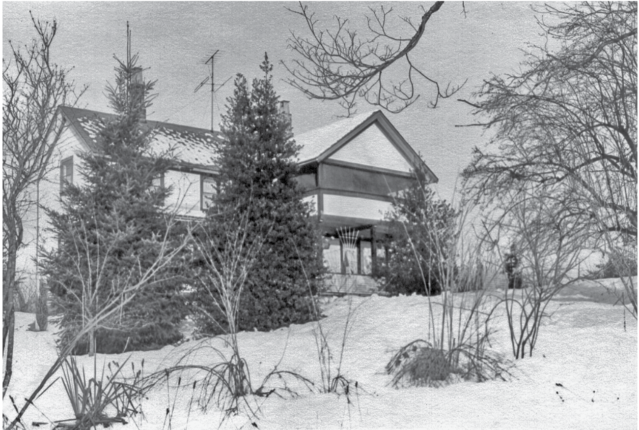
Haney House in the snow in January of 1972. Note that the upper balcony was closed in. The original open upper balcony was restored during the renovations done after the house was donated to the municipality.