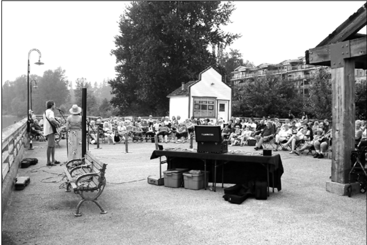
An appreciative crowd gathered to hear "Flint & Feather" on August 13.