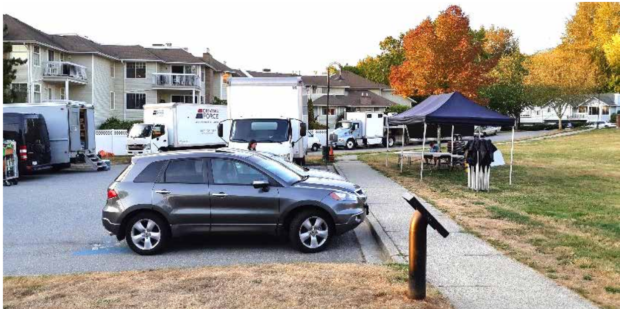
In no time at all our little parking lot filled with big trucks and tents popped up in the park.